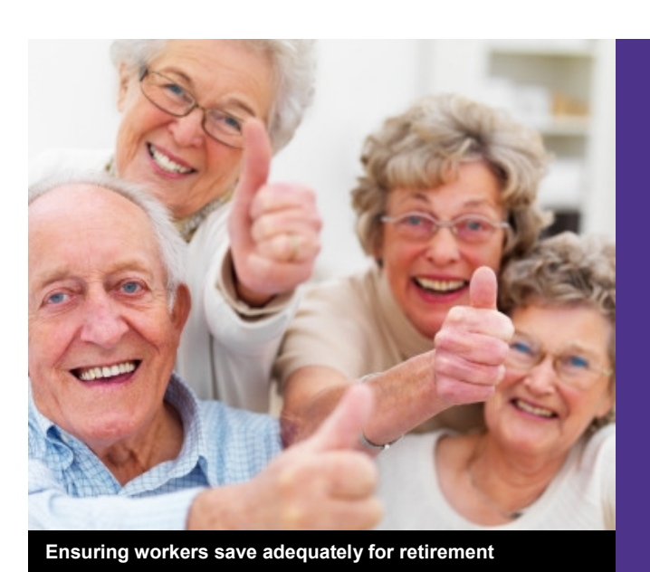
In This Issue

We've all seen the advertisements but what does this mean to the SME?