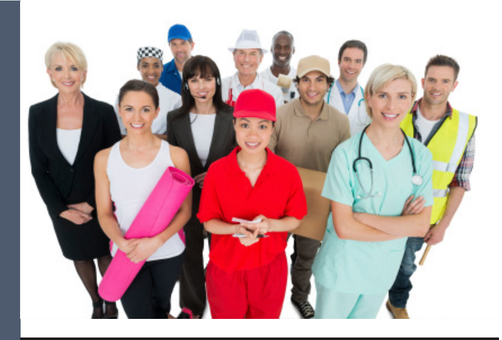
Analyse the workforce to determine what preparations are needed

Making changes to software and processes can take time so employers should plan ahead. Working with third party suppliers such as payroll software providers and the pension provider or administrator to ensure any necessary changes are made on time.